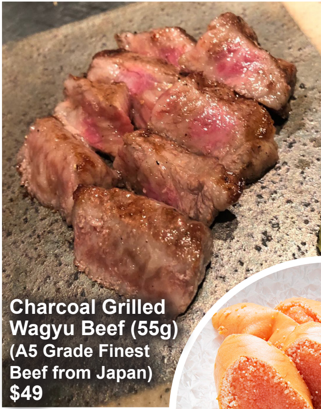
Charcoal Grilled Wagyu Beef (55g) (A5 Grade Finest Beef from Japan) $49