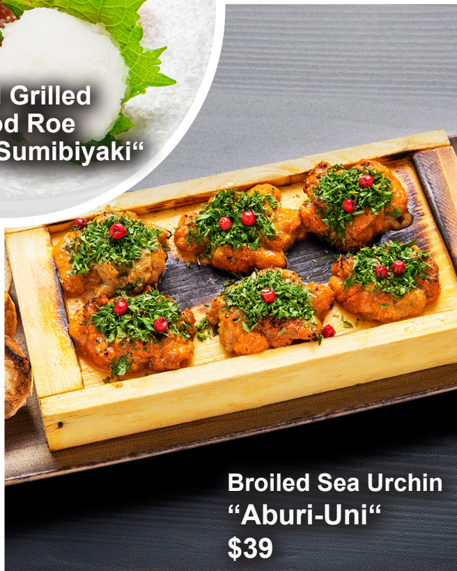
Broiled Sea Urchin "Aburi-Uni" $39