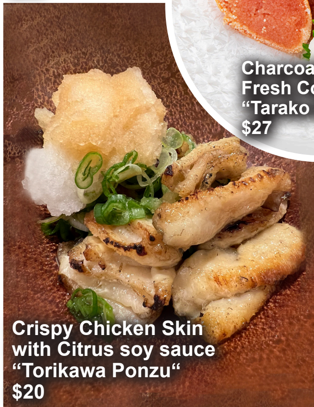
Crispy Chicken Skin with Citrus soy sauce "Torikawa Ponzu" $20