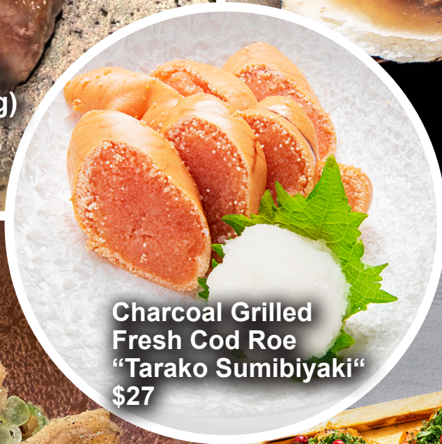
Charcoal Grilled Fresh Cod Roe "Tarako Sumibiyaki" $27